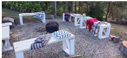
Places to sit and talk