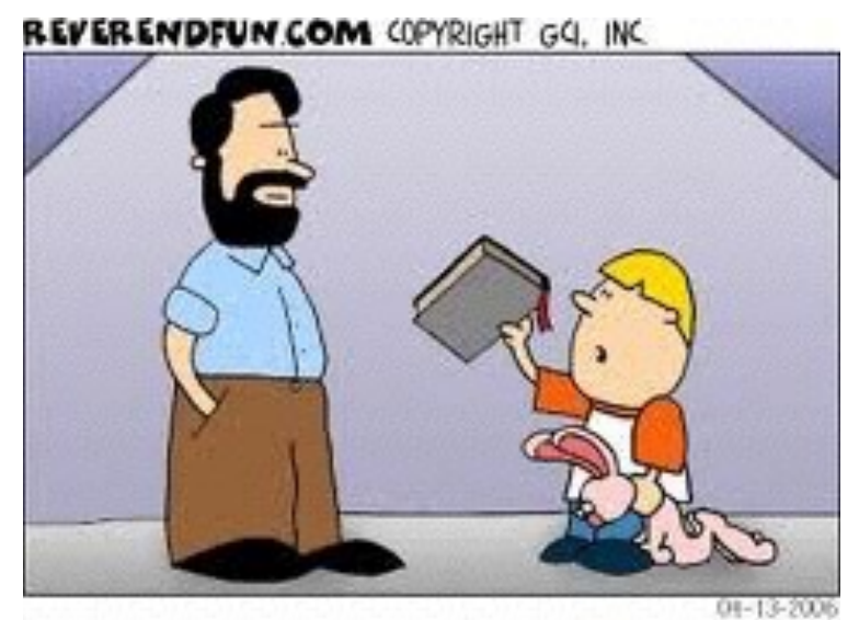
DAD, I NEED YOUR HELP TO FIND OUT WHERE IT TALKS ABOUT THE EASTER BUNNY IN THE BIBLE